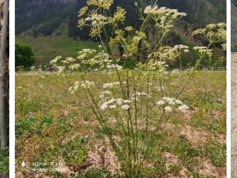
(Kala zeera Plant)