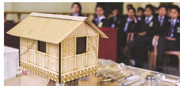
Earthquake Simulation Model