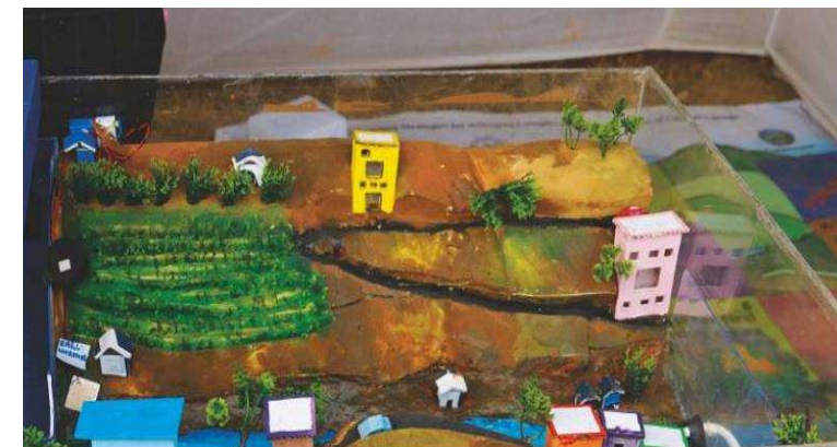
Flood Warning System